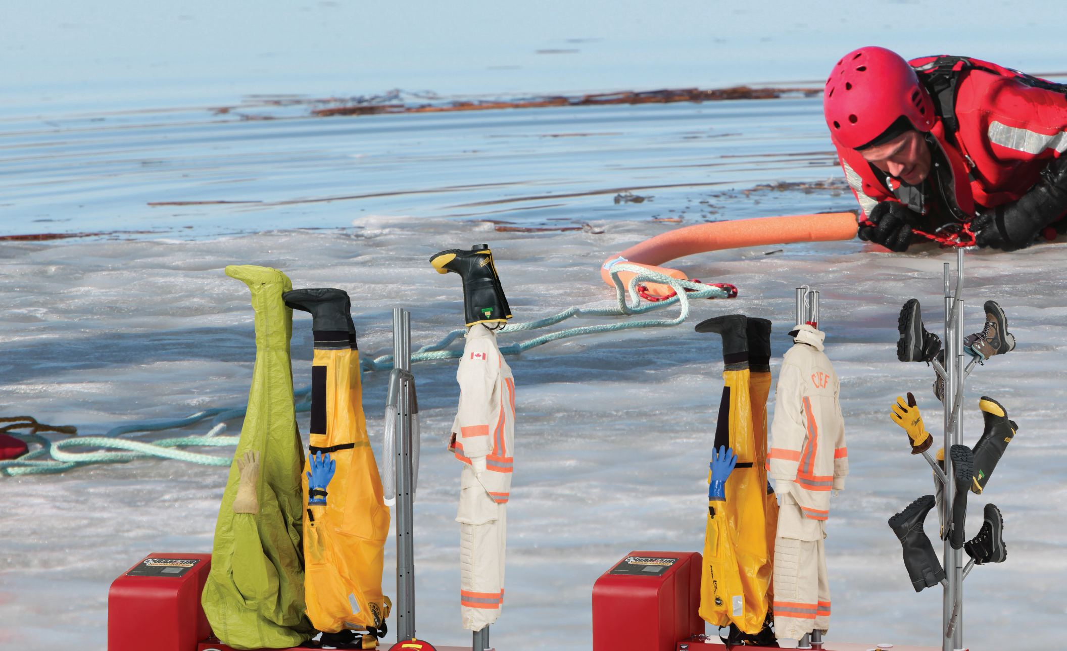
Special-Ops Gear Dryer Four Drying Units; 12 Accessory Ports; Invertible Stickmen Model T4-IHT