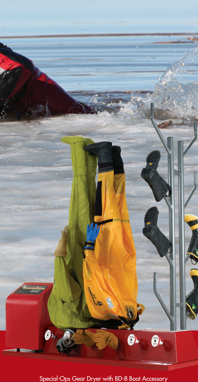
Special-Ops Gear Dryer with BD-8 Boot Accessory Four Drying Units; 12 Accessory Ports; Invertible Stickmen